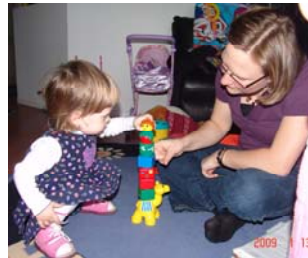
“Get down to a child’s level and PLAY!”

Supporting the developmental needs of children, birth to three years of age