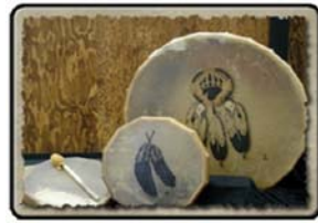
“The drum represents the great circle of life and the heartbeat of mother earth.” www.shannonthunderbird.com

AIDP and ASCD support aboriginal children both in the home and the community – working on developmental milestones